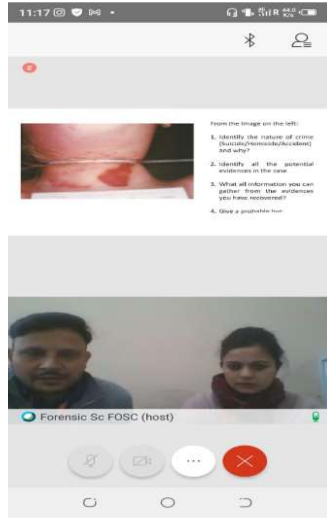
Pic:1 Organizers interacting with speaker over the presentation